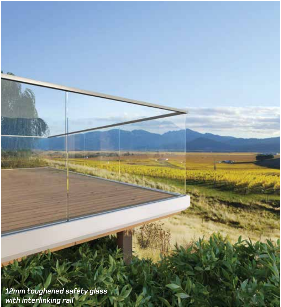
12mm toughened safety glass with interlinking rail