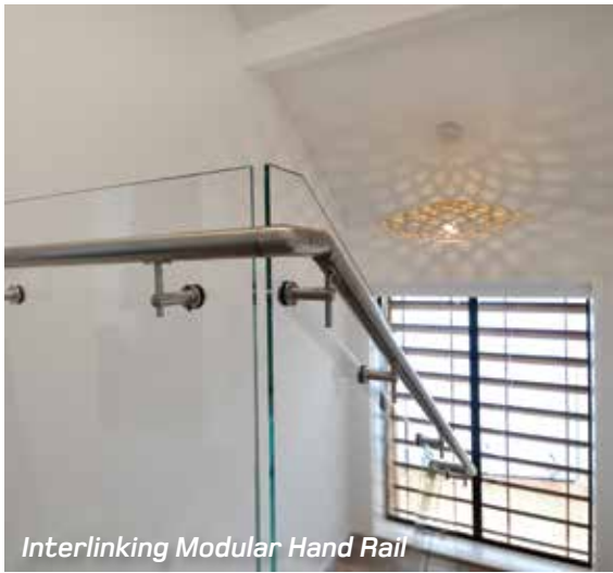
Interlinking Modular Hand Rail